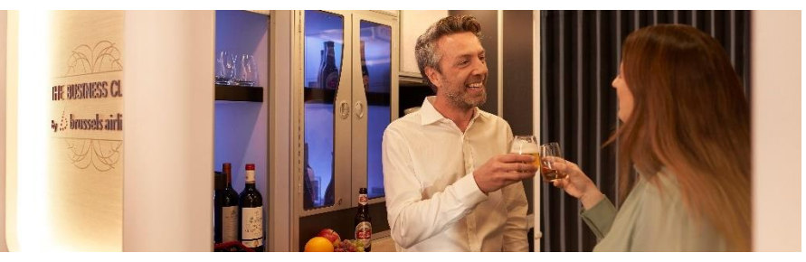
A Belgian touch: A beautiful design based on Belgian Art Nouveau and a Belgian bar