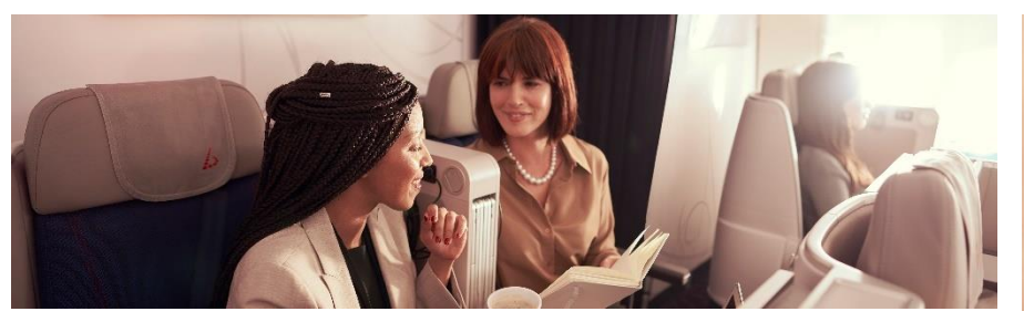
Our hospitality: even more comfort, privacy and plenty of room for working or relaxation